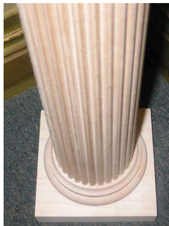
Martin Richards Design. COLLECTION